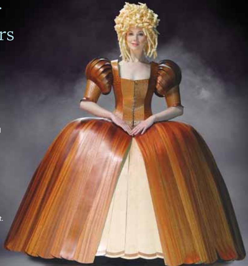
'Lady Of The Wood', David Walker, United States 2009 Winner Montana Supreme WOW® Award & Tourism New Zealand Avant Garde Section